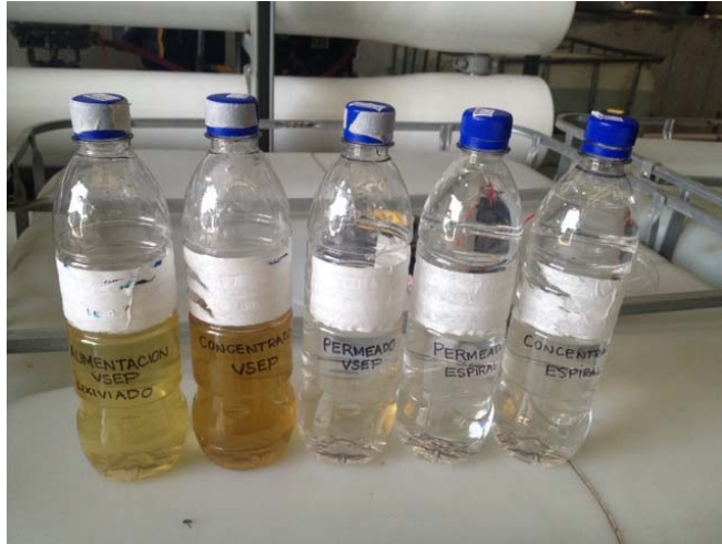
Photo: On-site samples of VSEP feed, VSEP concentrate, VSEP Permeate, and Spiral RO samples